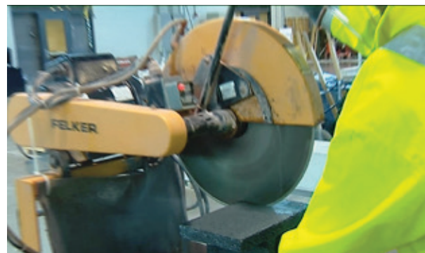
Worker cutting masonry block on a stationary masonry saw equipped with integrated water delivery system that continuously feeds water to the blade. Note water supply hose attached to top of shroud around blade.

Respiratory protection is not required for work with stationary masonry saws regardless of task duration.