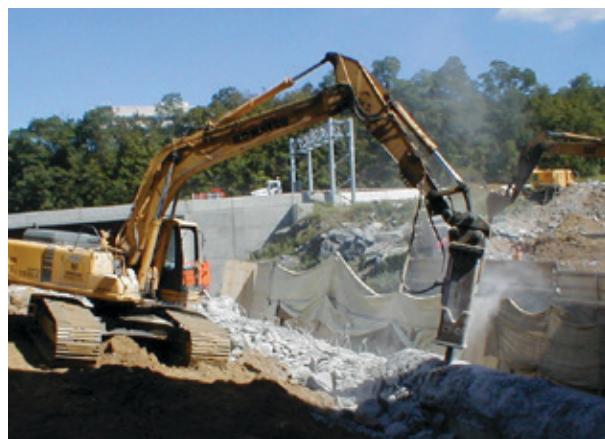
Excavator equipped with an enclosed cab and hoe-ram demolishing a concrete wall.

NOTE: When the operator exits the enclosed cab and is no longer actively performing the task, the operator is considered to have stopped the task. However, if other abrading, fracturing, or demolition work is performed by other heavy equipment and utility vehicles in the area while an operator is outside the cab, that operator is considered to be an employee “engaged in the task” and must be protected by the application of water and/or dust suppressants.