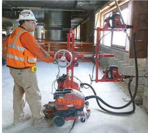
Worker is drilling horizontal holes in a concrete wall using two stand-mounted drills, each equipped with a dust collector. Note the shrouds around drill bits, black hose, and dust collector are attached to the stand.

Respiratory protection is not required when using handheld or stand-mounted drills equipped with a dust collection system, including for overhead drilling, regardless of task duration.