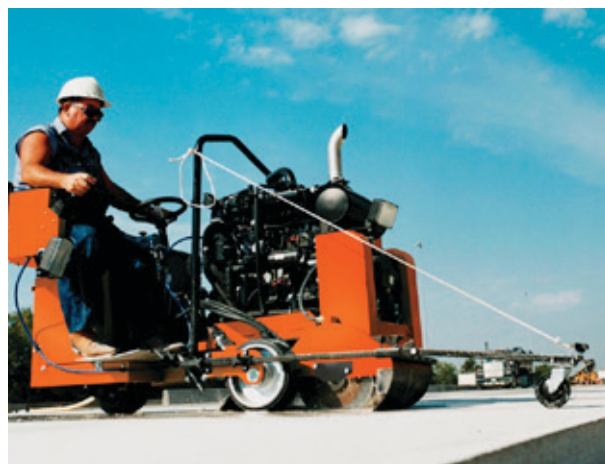
Worker cutting a groove in concrete roadway with drivable saw using integrated water delivery system.

Respiratory protection is not required for work with drivable saws regardless of task duration.