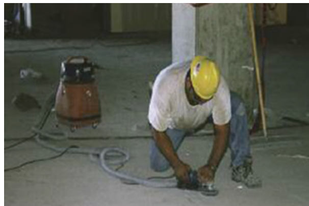
Worker grinding concrete floor with grinder attached to dust collector (background).

When using handheld grinders indoors or in enclosed areas (areas where airborne dust can buildup, such as a structure with a roof and three walls), employers must provide additional exhaust as needed to minimize the accumulation of visible airborne dust. See the section on Indoors or Enclosed Areas for more information.