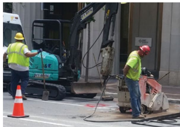
Worker using a walk-behind saw with an integrated water delivery system to cut asphalt roadway.

When working outdoors, respiratory protection is not required for work with walk-behind saws regardless of task duration. When working indoors, or in an enclosed location, respiratory protection with a minimum APF of 10 is required regardless of task duration.