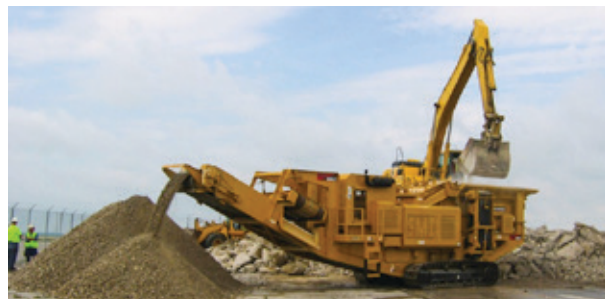
Crushing machine being loaded with construction debris by an excavator

Respiratory protection is not required for crusher operators regardless of task duration.