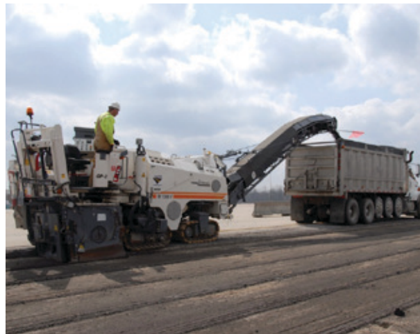
Milling machine milling asphalt road and loading debris into haul truck.

Respiratory protection is not required for work with small drivable milling machines (less than half-lane) regardless of task duration.