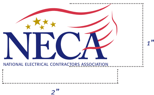
Minimum printed size with tag line