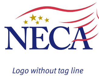
Logo without tag line