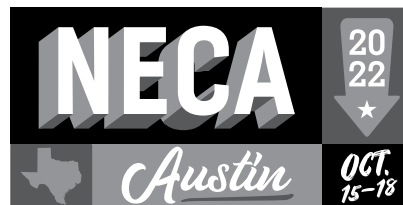
NECA 2022 CONVENTION LOGO