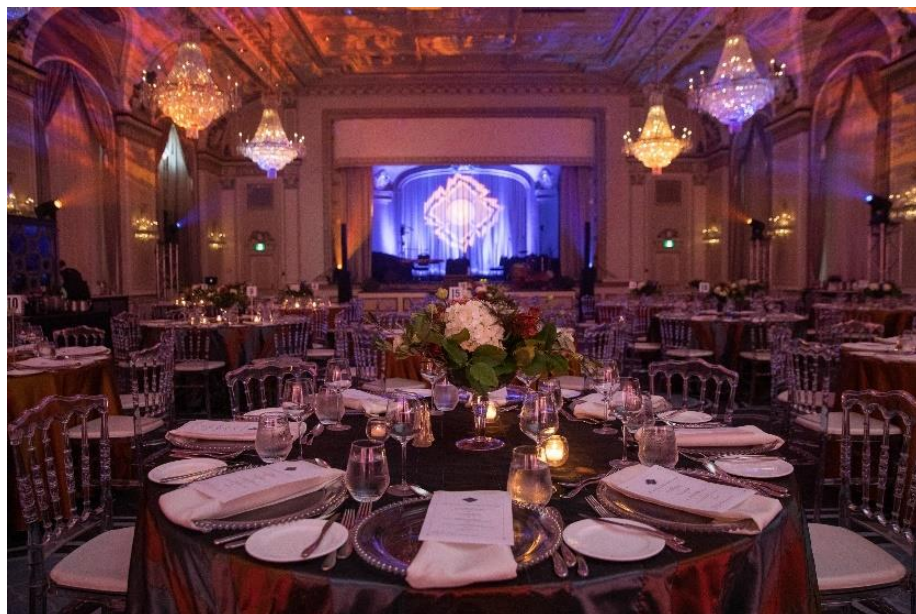
Formal Dinner Setting

We had the largest attendance ever at an Academy Annual Meeting with 113 Fellows and 104 companions for a total of 217 people. Many Fellows arrived early and spent several days at the Richelieu. The Opening Reception was held on the lawn overlooking the seaway.