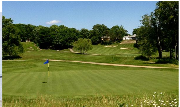
Cape Neddick Country Club