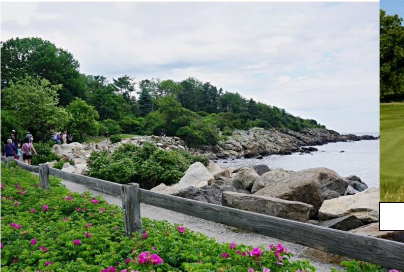
The Marginal Way in Ogunquit, Maine