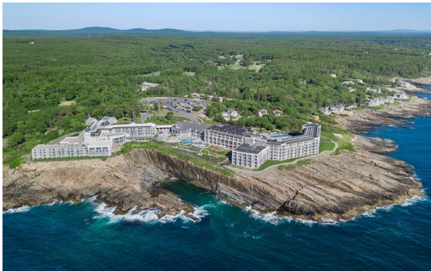
The Cliff House

53 rd Annual Meeting Cape Neddick, Maine June 13 to 15, 2023