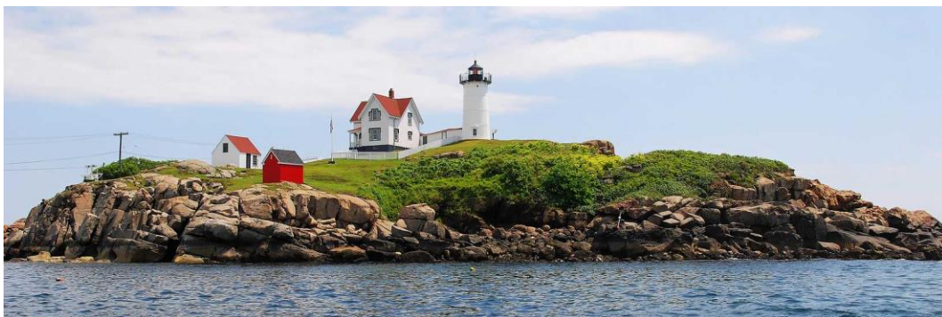
Nubble Lighthouse Cruise