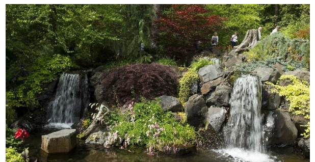
Hagadone Casco Bay Home Gardens