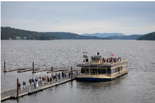
Fellows and their Guests arriving at the Hagadone Event Center

There were many highlights and memories :