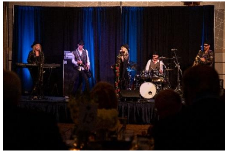
Stevie Nicks Illusion