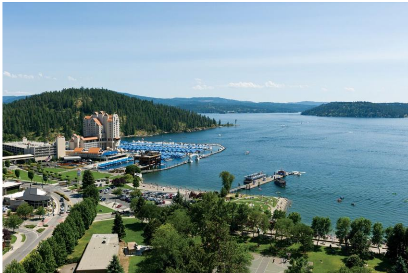
The Coeur d'Alene Resort

52 nd Annual Meeting Coeur d'Alene, Idaho June 8 to 10, 2022