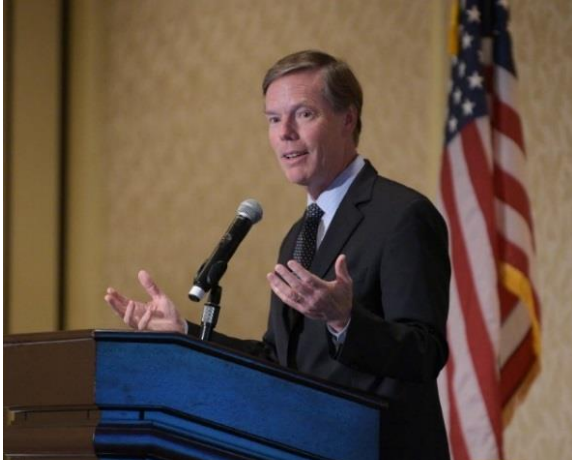
Ambassador Nick Burns addresses the General Meeting