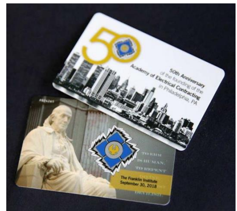
Yes, that's the room key for Fellows (front & back) at the Montage!