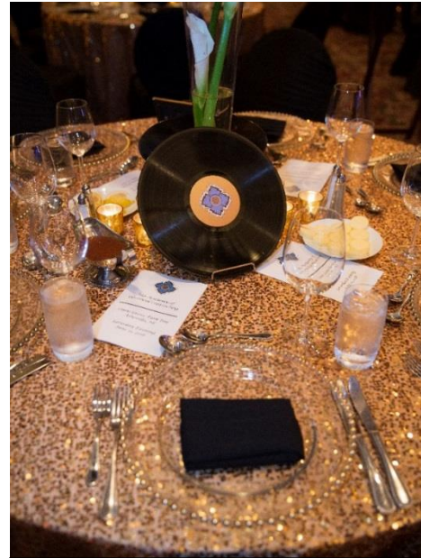
A Most Beautiful Setting for Our Formal Dinner