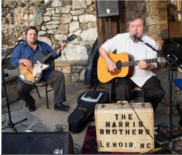
Our Opening Reception Entertainment