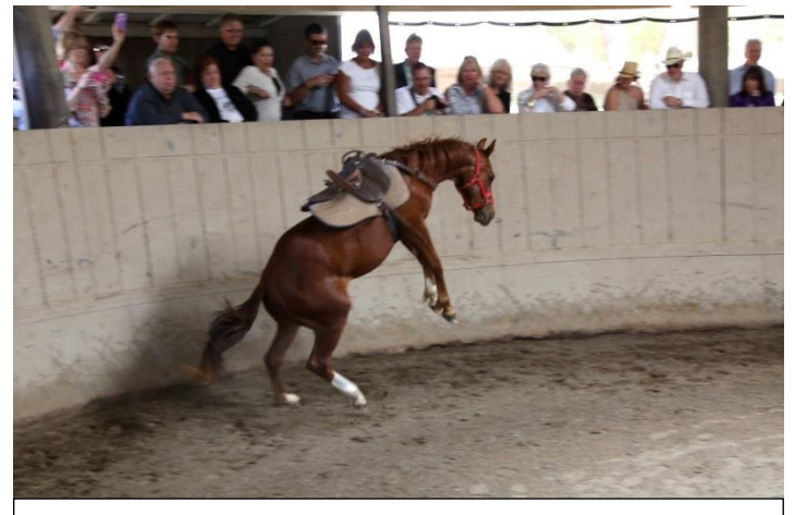
Reacting to first saddle, "He seemed like such a nice man"!

Gaining Trust "Join Up" at the "Round Pen"