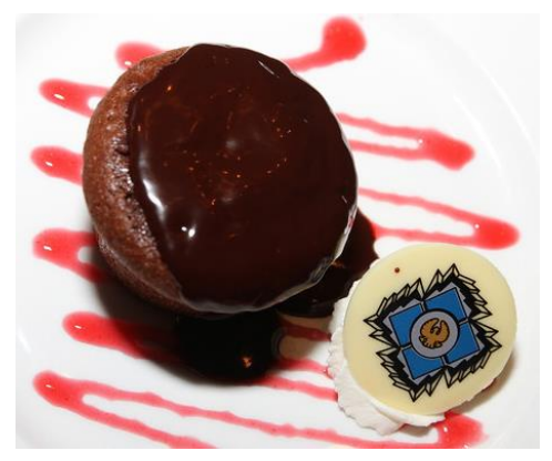
A dessert fit for a Fellow!

And speaking of photos : We'll be printing and mailing the customary photos of the formal dinner tables later this summer, but if you would like to see the photos taken (by the professional photographer), the website link is: