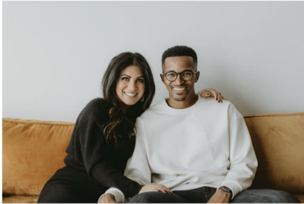
NECA NOW 2023 EXECUTIVE LEADERSHIP CONFERENCE