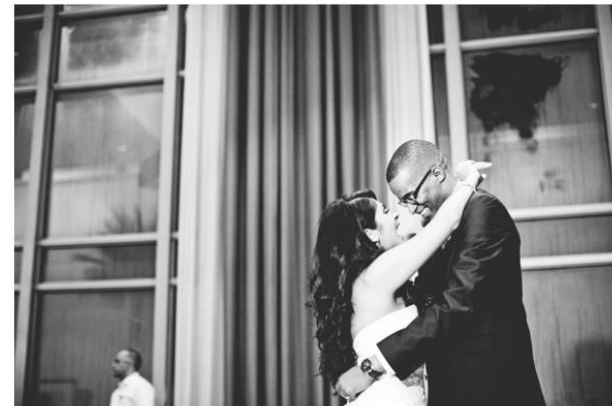
NECA NOW 2023 EXECUTIVE LEADERSHIP CONFERENCE