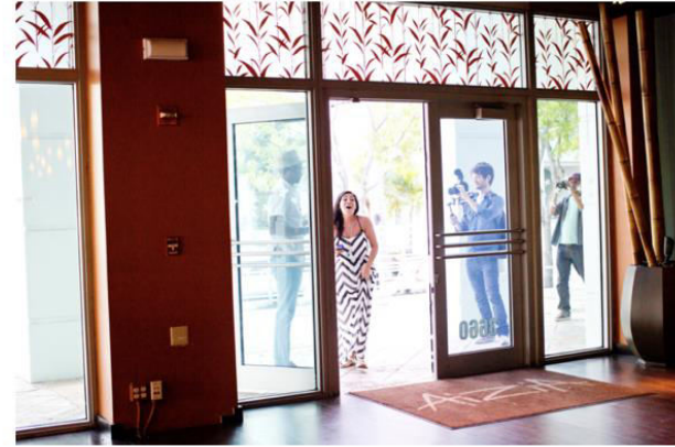
NECA NOW 2023 EXECUTIVE LEADERSHIP CONFERENCE