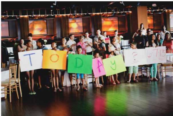
NECA NOW 2023 EXECUTIVE LEADERSHIP CONFERENCE