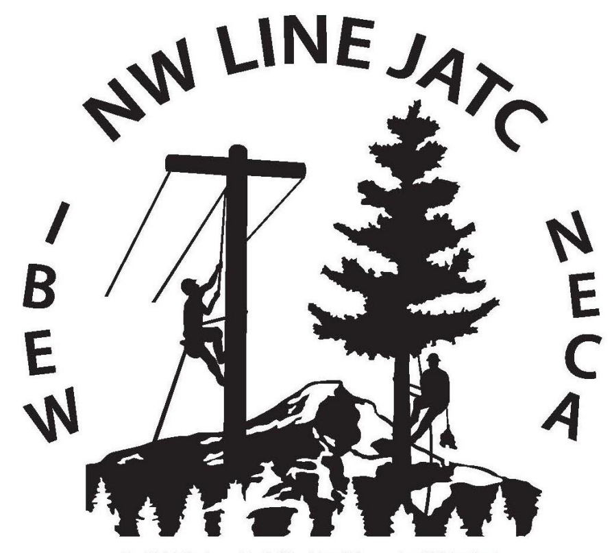
LINE • VOLTA • TREE