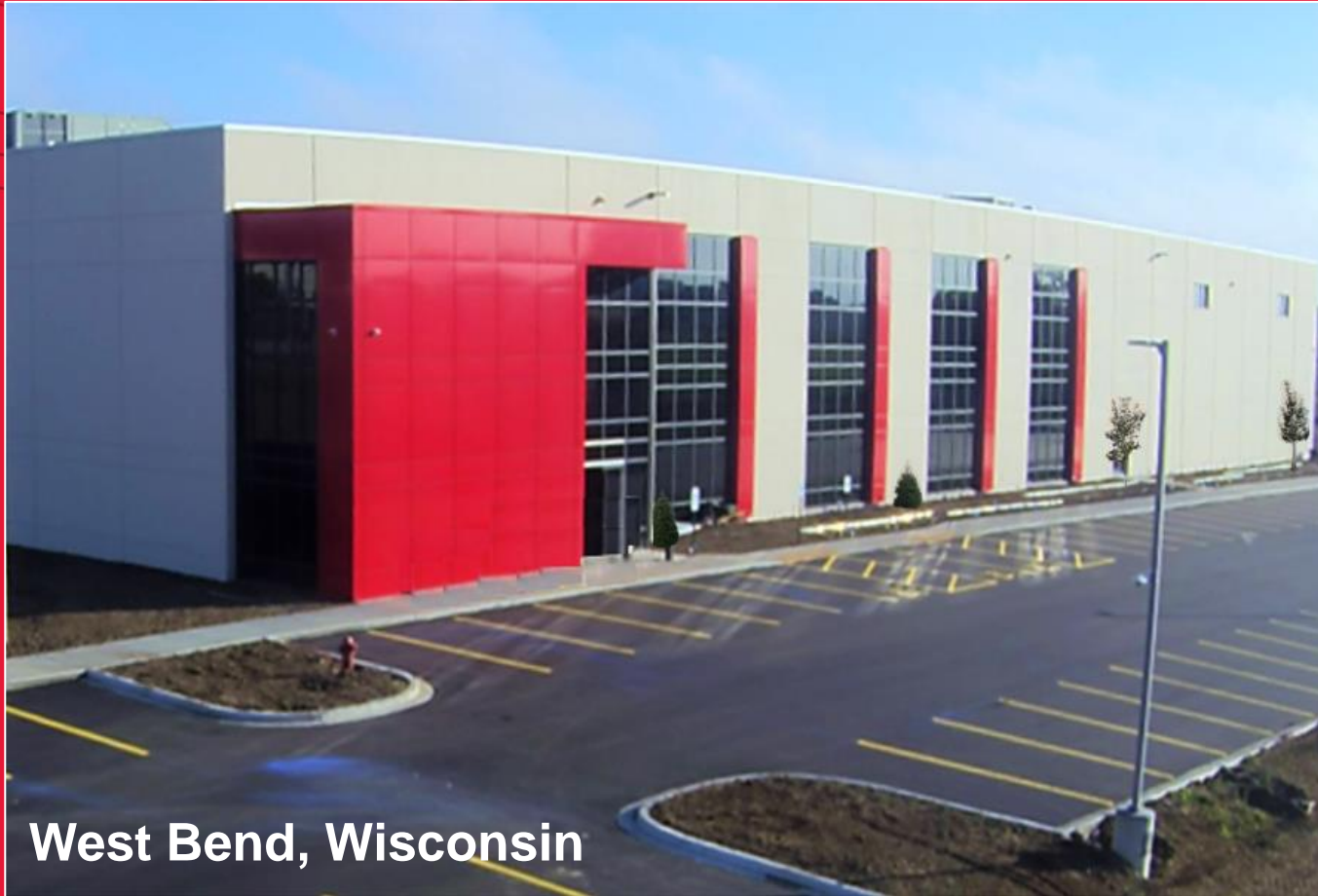
West Bend, Wisconsin